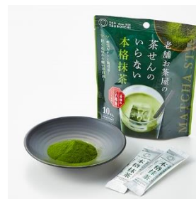
Japanese tea products from Tsuboichi Seicha,