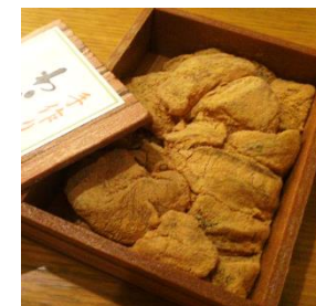
Warabimochi and Japanese sweets from Angetsudo,

We hope you will enjoy these foods skillfully arranged by the chefs at Kampachi.