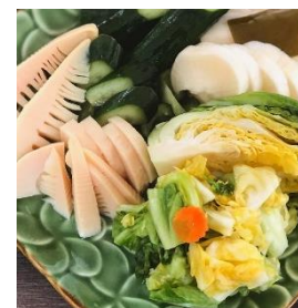
pickled foods from Iseya Shoten.