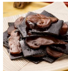
Kombu seaweed from Oguraya,