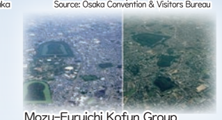
Mozu-Furuichi Kofun Group