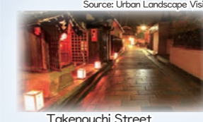
Takenouchi Street