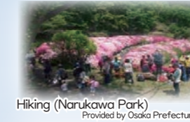
Hiking (Narukawa Park)