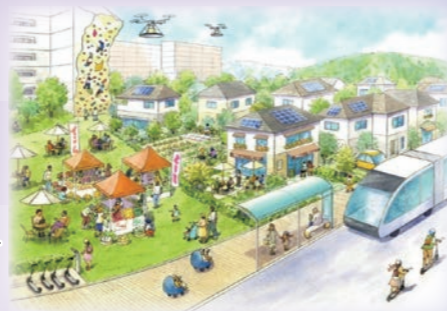
Future Vision of New Town Image