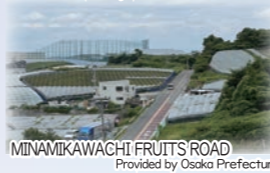
MINAMIKAWACHI FRUITS ROAD