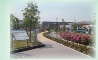
Utilization of the area around the supply treatment facility (greenway)