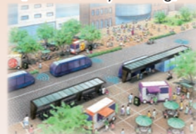
SMI Urban Center Line and Walkable Space