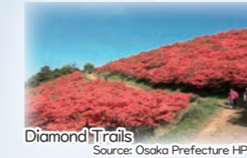
Diamond Trails