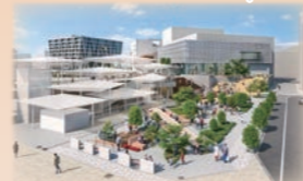
Kita-Osaka Express Extension City Planning

«Town development in line with railroad development»