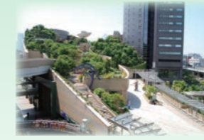
A green oasis in the urban area (Namba Parks)