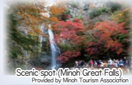
Scenic spot (Minoh Great Falls)