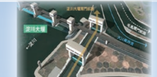
Yodo River Weir Locks (image)