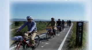
Cycle routes utilizing the riverside