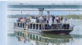
Yodo River Boat Transport