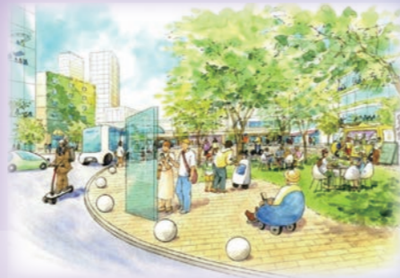
Future vision of station space Image