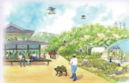
Future vision of nature-rich foothills Image