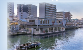
TUGBOAT TAISHO