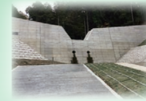
Landslide prevention facilities (erosion control weirs)