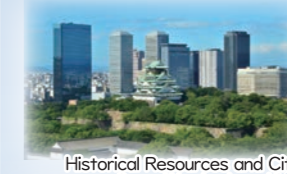
Historical Resources and Cities