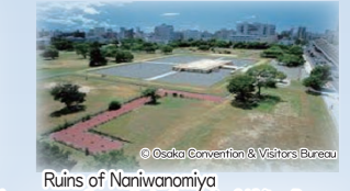
Ruins of Naniwanomiya