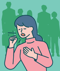
Turn your face away from the people around you