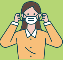
Wear a mask

Be careful not to cough or sneeze on those around you.