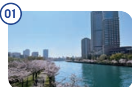
Yodogawa Riverside Cycle Line