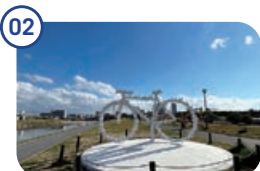
Yamatogawa Riverside Cycle Line