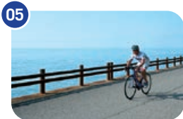
Round-the-cape course with spectacular views