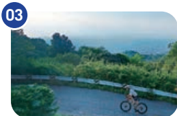
To the mountain pass with spectacular views of the Osaka Plain The classic Grape Hill & Jusan Pass course