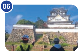
A course to discover fascinating city "Kishiwada"