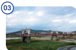
Ishikawa Riverside Cycle Line