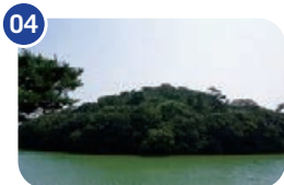
A course to easily experience the Mozu Kofun Group in Sakai city