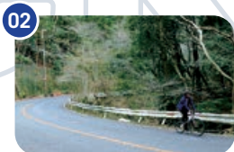
From Minoh Falls to Katsuoji Temple! A tour of Northern Osaka's classic sightseeing spots