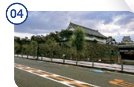
Osaka Bay Bayside Cycle Line