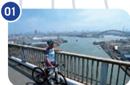
Discover Osaka, the city of water! Ferry and gulf coast ride