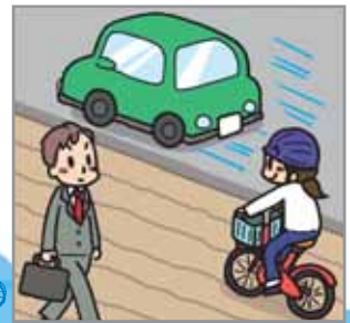
Pedestrians have priority on sidewalks. Travel on the roadside.