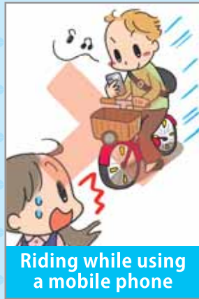
Riding while using a mobile phone