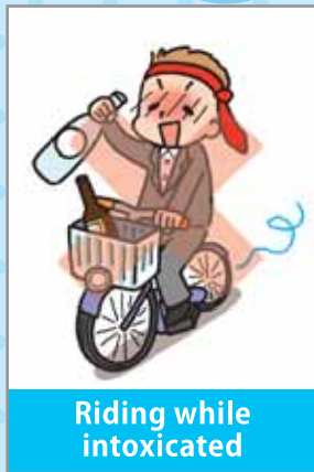
Riding while intoxicated