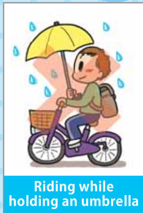
Riding while holding an umbrella