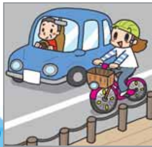
Travel on the left side of roads.