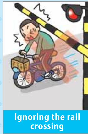
Ignoring the rail crossing