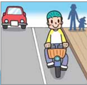
Bicycles must travel on roads and not on sidewalks.