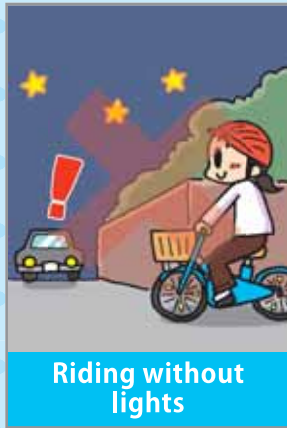
Riding without lights