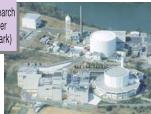
Kyoto University Research Reactor Institute